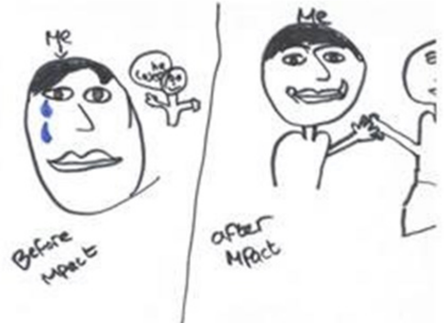
Drawing from a child participant of the M-PACT programme

As part of the licence agreement organisations are required to submit end of programme data to the Forward Trust to support the ongoing evaluation of the programme. This helps to build the evidence base for the intervention and contributes to continuous improvement activities.